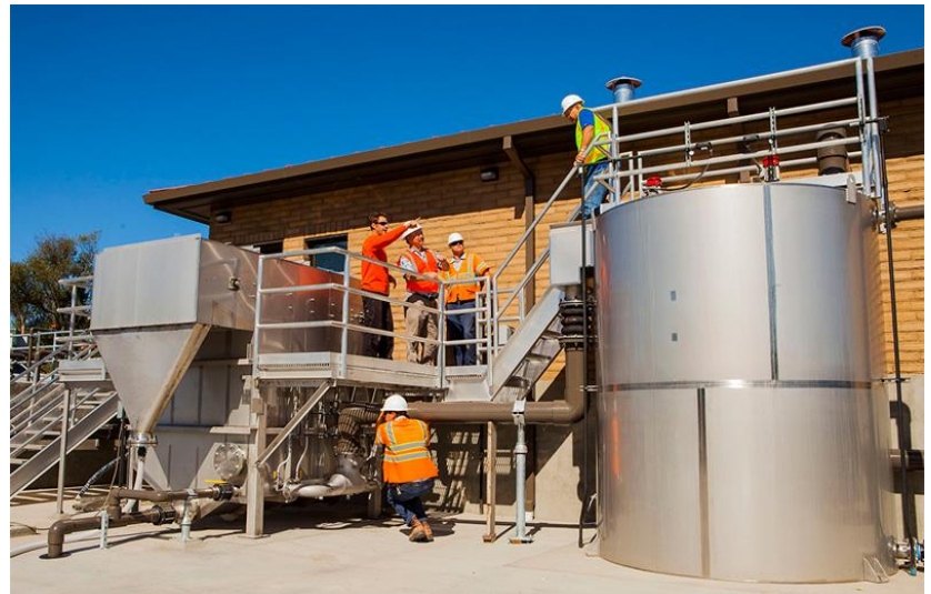
Suspended Air® Flotation System, mixing tank on the right and flotation cell on the left.

When the flocculated particles are induced with SAF microbubbles, the particles become highly buoyant and float to the surface. Solids are skimmed off the surface and the effluent is treated further as required by the Title 22 Statute. The SAF’s removal of solids is so efficient that treated water exceeds the Statute requirement of 2 NTUs prior to filtration. The Schreiber Fuzzy Filter incorporated downstream has dramatically extended cycle times and required maintenance treatment systems are tended and sustained with much less effort and resources.