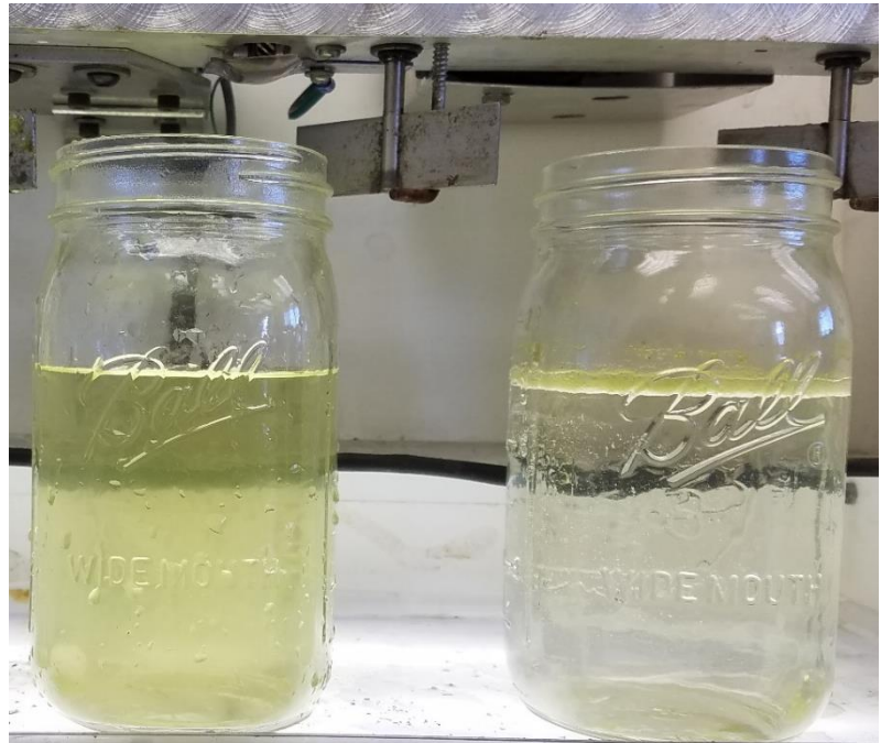
Samples taken from a facultative treatment facility. The left sample has not been treated and the right sample has been treated by the same methods as the Suspended Air® Flotation System but in a jar test environment.

After GSCD's wastewater treatment plant was upgraded in March 2014, the results comfortably exceed the requirements. The SAF does an exceptional job of removing algae from surface water. On average, the SAF's performance is above 95% in the removal of total suspended solids (TSS) and turbidity. Results from the SAF alone consistently exceed the Title 22 requirement of no greater than 2 NTUs for water clarity. In combination with the filter, this wastewater boasts <0.5 NTU on a regular basis. The biological oxygen demand (BOD5) is repeatedly reduced over 92%. When treated wastewater has reduced levels of BOD, great benefits for land-use efficiency and lagoon elimination are available. With these kinds of results, dependable clear effluent is achievable.